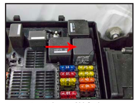
04-10 Jaguar XJ Series Relay located on the right side of the vehicle in the engine compartment.