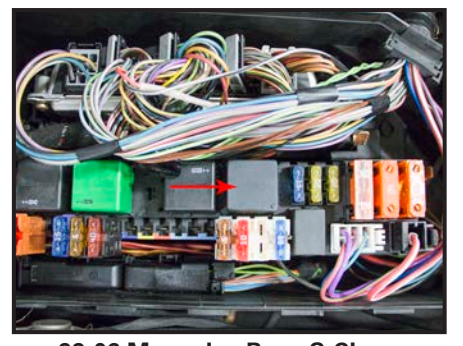
99-06 Mercedes-Benz S-Class Relay located on the right side of the vehicle in the engine compartment.