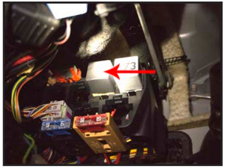
99-05 Audi A6 allroad quattro (C5) Relay located on the left side of the vehicle under the dashboard.