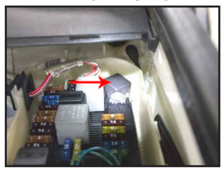
02-09 Mercedes-Benz E-Class Relay located on the left side of the vehicle by the firewall.