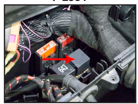
07-11 Audi A6 (C6) Relay located on the left side of the vehicle under the wiper cowl.